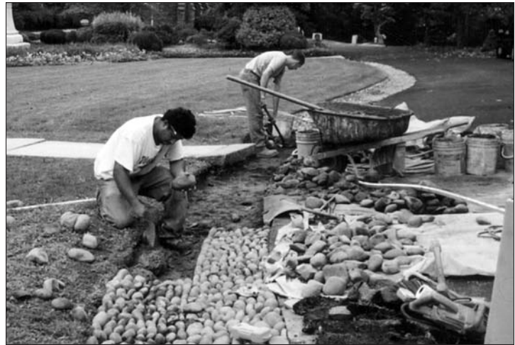
Workers from Lorton Contracting Co. rebuilding the cobblestone gutters on the Ellipse.

Roadwork accomplished this past August started by milling away up to a foot of old tar, stone chip and recycled asphalt to reach just below the edge of cobblestone gutters installed from the middle of the 19th century onward as the terraced paths and carriage ways of Oak Hill were created. Often the gutter was completely filled with turf or asphalt and had to be uncovered by precisely operated small “Bob-Cat” loaders or, in many cases, by hand. The milling machine, having cut only one half the width of the roadway on its first pass now returned to finish removal of old material and reshape the outside edge of the road. After power sweeping the gutters and a final grading and rolling of the exposed roadway base, paving could begin. A smooth 2 1/2 inch deep layer of hot asphalt was spread in one pass. An unusual amount of handwork was required to ensure that the new surface would closely meet the irregular edge of the stone gutters and, on the other side of the road, be sharply terminated and compacted at its unconstrained outside edge. Rolling the new work was equally exacting and produced the final smooth flat surface required to send rain water to the gutters thus minimizing side slope erosion.