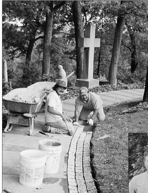
Left: Workmen lay trim along the walkway of the Renwick Chapel Cremation Sites.