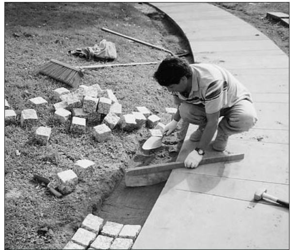
Work continues on finishing touches to the new Renwick Chapel Cremation Sites.