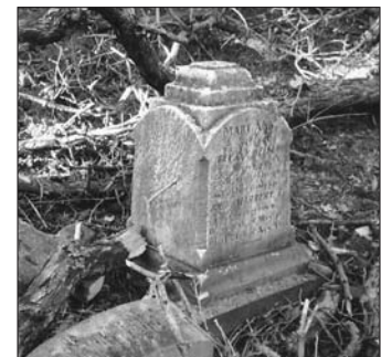
Our first look at the scene on March 2nd. The Marbury Obelisk (shown upper left) survived.